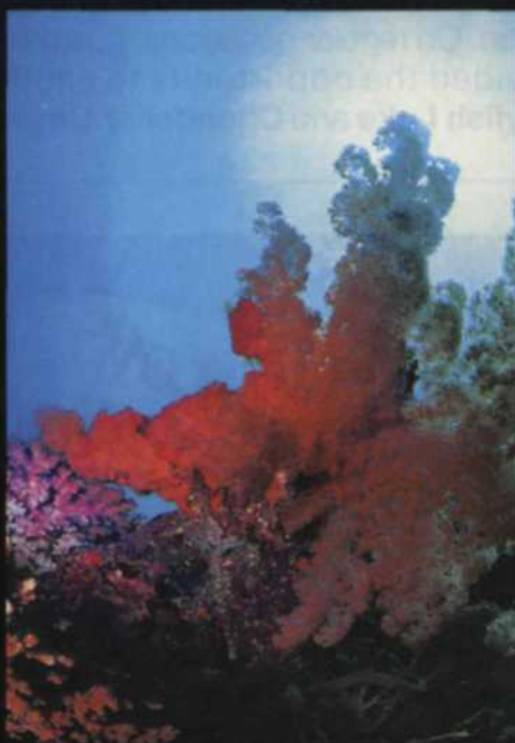
Above: Fiji is known for its soft corals. Below: Clownfish and the anemone that shelters them.

Slivers of light squeezed through the window shades and the sounds of chirping birds encouraged us to slip from the covers. As we entered the main room of our lodging, the aroma of freshly cooked food filled the air and our bure girl greeted us warmly. She had arrived earlier and had a hot breakfast ready and waiting. What a way to start another day in Laucala paradise!