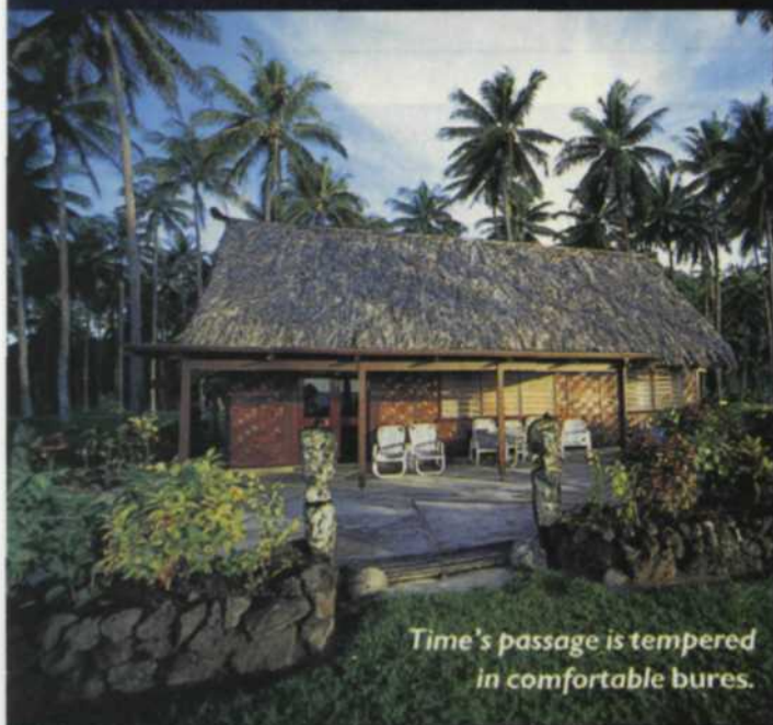
Time's passage is tempered in comfortable burees.

TEXT AND PHOTOGRAPHY BY JACK AND SUE DRAFAHL